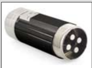
Extension, nickel plated