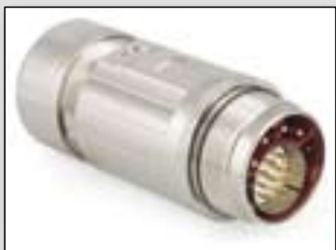
Extension, nickel plated