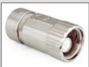
Plug, nickel plated

HELUTEC F series connectors provide signal and power contacts, combined in a single housing. Separate shielding of signal and power wires provide excellent EMC conformity.