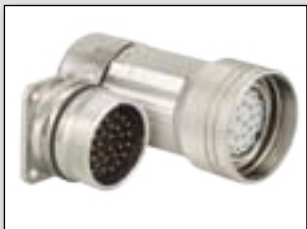
Plug and receptacle, nickel plated