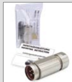
C series power connectors