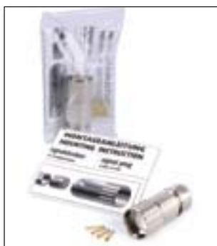
A series signal connectors

HELUTEK connectors are delivered as service packs – including contacts (not mounted) and mounting instruction. Customer specific service packs on request.