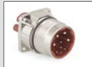
Receptacle straight, nickel plated