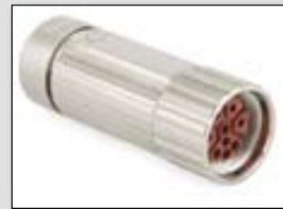
Plug, nickel plated