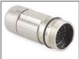
Extension, nickel plated