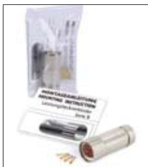
B series power connectors