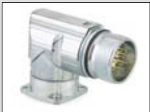
Receptacle angled, chromated