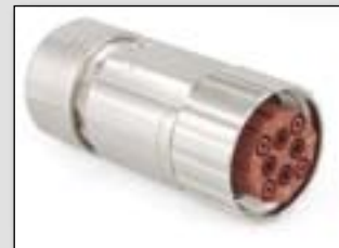
Plug, nickel plated