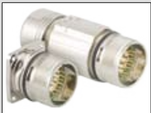
Extension and receptacle, nickel plated