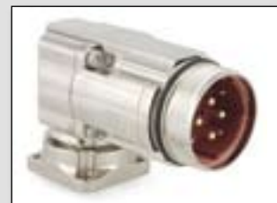
Receptacle angled, nickel plated