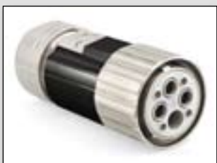
Plug, nickel plated

Plug type housings offer integrated vibration protection.