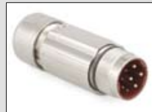
Extension, nickel plated