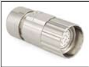
Plug, nickel plated

M23 type connector housings are also available in stainless steel. Housings with external thread offer standard vibration protection.